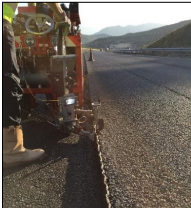
Fig. 2: Joint installation using the TOKOMAT® process