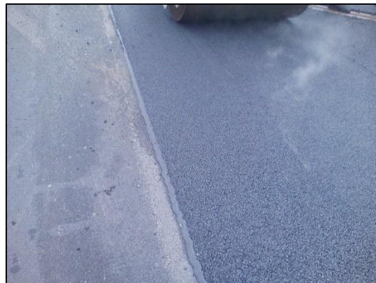
Fig. 3: TOKOMAT® joint along rolled asphalt

The TOK®-Riegel joint compound used in the TOKOMAT® process is, just like the bitumen joint tapes regulated in the ZTV Fug-StB, a joint material tested and approved according to the TL Fug-StB. The quality and compliance of the bitumen joint tapes and TOK®-Riegel with the standards are monitored by an external, accredited test institute three times a year. By contrast, standard EN 14188-1 for N1- and N2-type hot pouring compounds often does not require external monitoring for this area of application, which can impact on the quality.