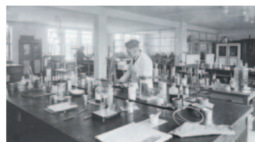
Pioneers at work developing the Petrolatum-Tape.

For 100 years, the brand name of the mother company (derived from the Latin word for "to seal") has been synonymous with innovation. Even as early as 1927, the then young mother company developed a special petrolatum tape designed to protect pipelines. In no time, this world-wide first Petrolatum-Tape became synonymous with passive corrosion prevention on pipelines. And from this point onwards, this German brand has been known as a pioneer in the development and production of innovative sealing solutions.