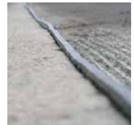
Simple insertion, overhang by 5mm on rolled asphalt