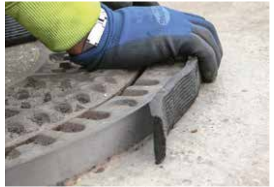
Ideal for a multitude of different materials and applications, such as manhole components and concrete edges.

The high-performance, self-adhesive TOK ® -Band SK can now be used without primer. This means that laborious and time-consuming priming and air-drying of the edge of a joint is no longer necessary! No primer also means no hazardous substances that have special transport and storage requirements.