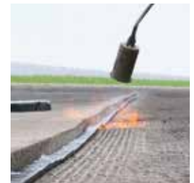
Activate TOK ® -Band A with a flame in seconds