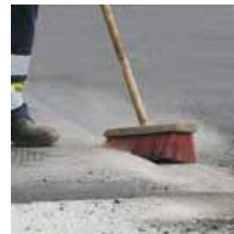
Clean and dry the edge

This innovative layer remains adhesive for a long period after activation. It can also be reactivated in the event that work gets interrupted. If the joint edge is clean then there is also no need to spend time priming the edge. The TOK ® -Band A can be applied in half the time of other melting bitumen joint tapes!