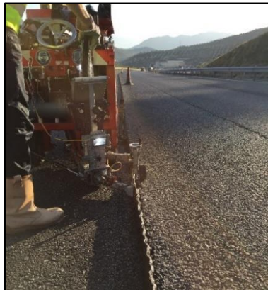
Fig. 2: Joint installation using the TOKOMAT® process