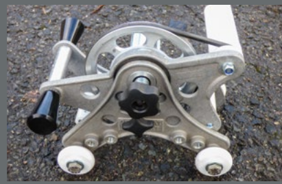
DEKOMAT®-1 Universal. Robust. Durable.