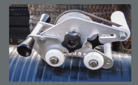
DEKOMAT®-Mini For small nominal pipe widths and confined space in the pipe trench.