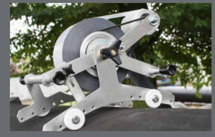
DEKOMAT®-KGR Junior For longer rolls and larger nominal pipe widths.